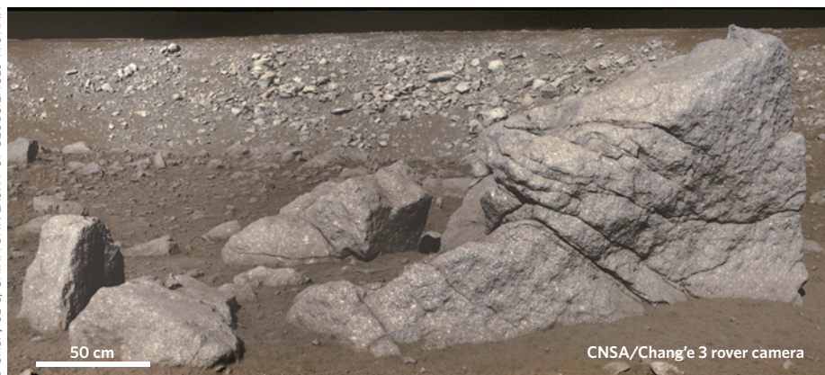
Figure 2 | Loong Rock. The porphyritic rock outcrop, about 1.5 m in height, is located about 3 m away from the Yutu rover. In the background is a young crater that is 450 m in diameter, with a rocky wall.

processes and space weathering, as well as the formation of the Earth–Moon system.